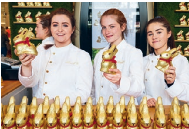
Lindt Gold Bunny personalization for the benefit of the Temple Street Children's Hospital in Dublin.

Lindt launched a series of successful Easter campaigns to reach out to families. The Easter treasure hunt for the Gold Bunny, with product tastings, organized in collaboration with six Royal Horticultural Society gardens, in premium shopping centers and, for the first time, in Hampton Court Palace were all a big success. In Ireland, brand awareness and interaction with consumers were increased through an activity, giving consumers the opportunity to personalize their own Gold Bunny in return for a donation to Lindt's charity partner, Temple Street Children's Hospital. The Lindt Teddy with the Christmas sweater was again a top seller, available this time in a traditional green color.