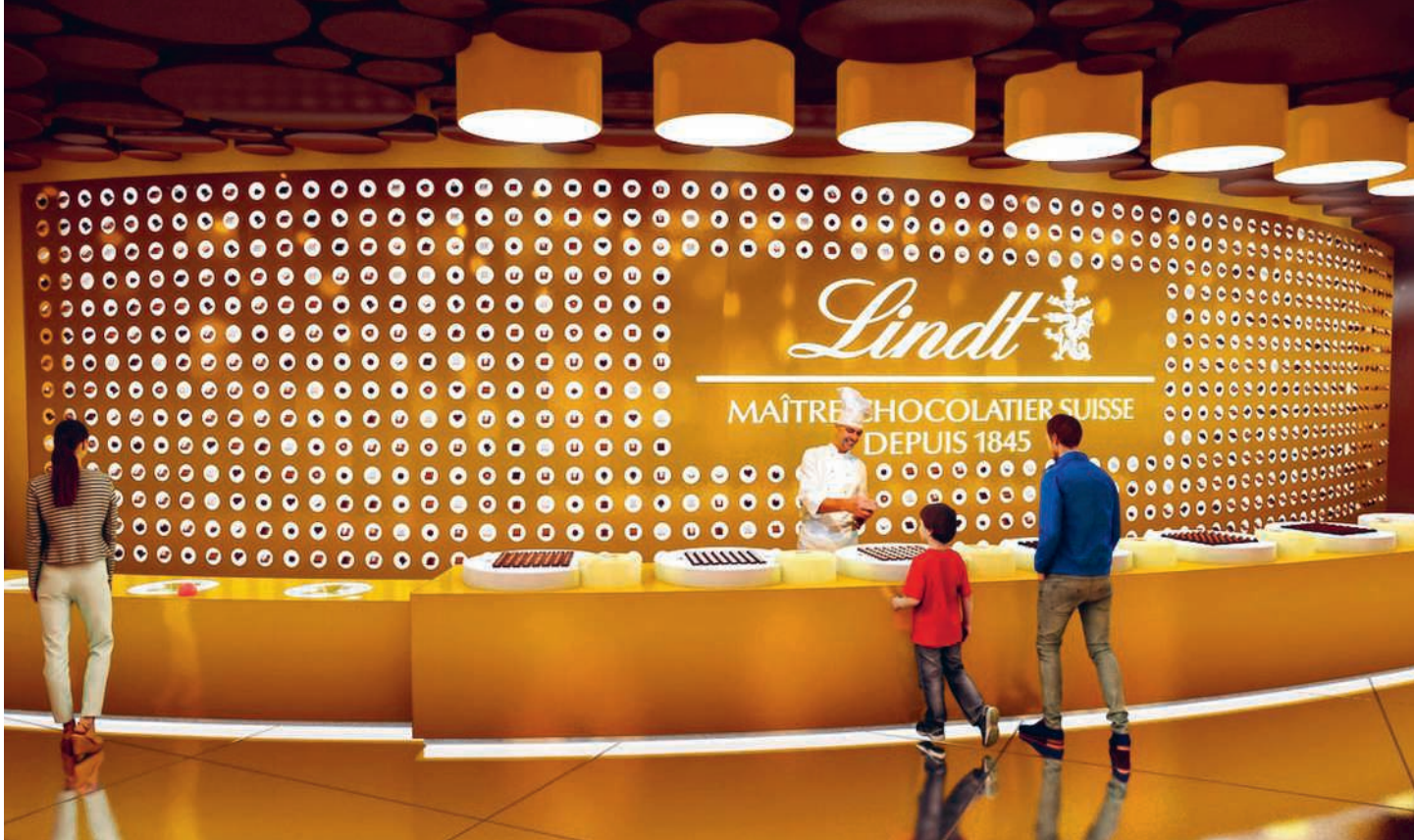
A special visitor highlight in the Lindt Home of Chocolate is the tasting room for pralines.