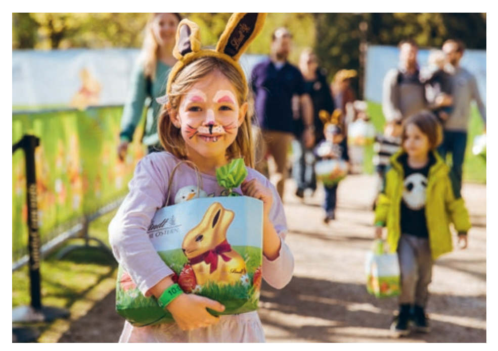
Austria's biggest Easter bunny hunt included many exciting activities in the Botanical Gardens of Vienna's Schönbrunn Palace.

Slovakia. The successful brands Lindor and Excellence were major drivers of this sales growth, while the seasonal business performed well, thanks to successful advertising campaigns for the Lindt Gold Bunny and the Lindt Teddy. In 2017, the Gold Bunny was yet again the top seller among hollow chocolate figures, while the established itself as a popular icon in the Christmas business.