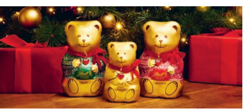
The successful Teddy Crew, which has taken England by storm.

Lindt launched a series of successful Easter campaigns to reach out to families. The Easter treasure hunt for the Gold Bunny, with product tastings, organized in collaboration with six Royal Horticultural Society gardens, in premium shopping centers and, for the first time, in Hampton Court Palace were all a big success. In Ireland, brand awareness and interaction with consumers were increased through an activity, giving consumers the opportunity to personalize their own Gold Bunny in return for a donation to Lindt's charity partner, Temple Street Children's Hospital. The Lindt Teddy with the Christmas sweater was again a top seller, available this time in a traditional green color.