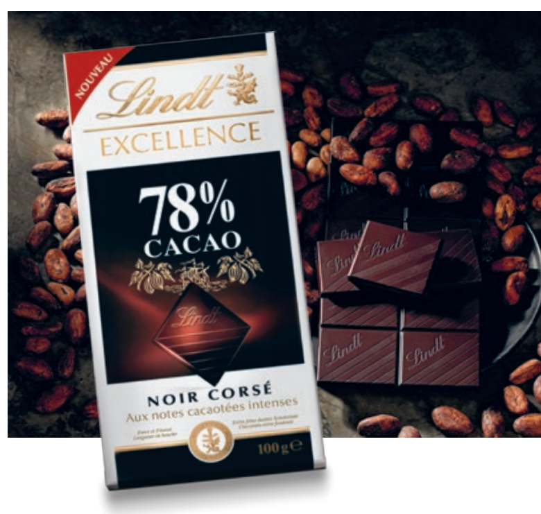
New Lindt Excellence recipe with 78% cocoa.

Pralinés with a new coconut recipe. Sales channels were extended to smaller shop formats in large cities with high sales growth, so consumers have less far to travel to buy their favorite Lindt products.