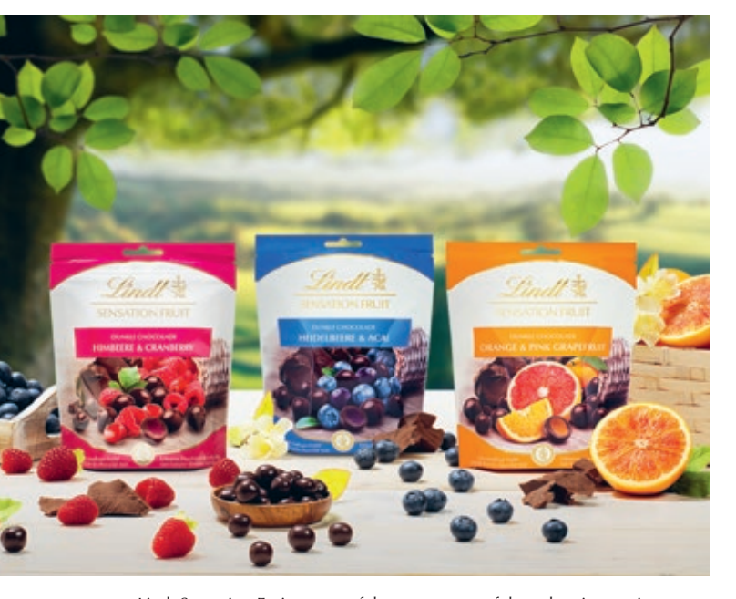
Lindt Sensation Fruits – one of the most successful product innovations from France.