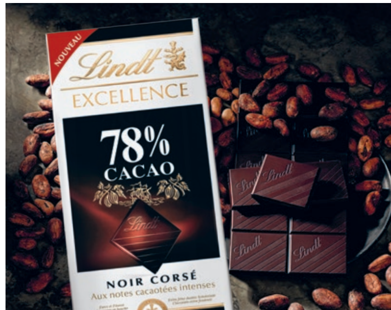
New Lindt Excellence recipe with 78% cocoa.

Pralinés with a new coconut recipe. Sales channels were extended to smaller shop formats in large cities with high sales growth, so consumers have less far to travel to buy their favorite Lindt products.