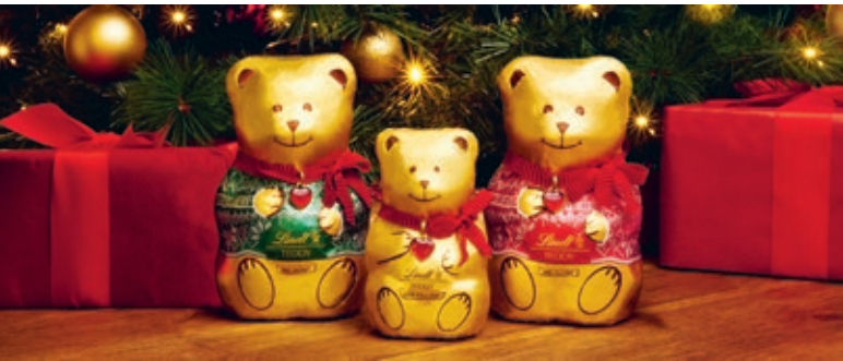
The successful Teddy Crew, which has taken England by storm.

Lindt launched a series of successful Easter campaigns to reach out to families. The Easter treasure hunt for the Gold Bunny, with product tastings, organized in collaboration with six Royal Horticultural Society gardens, in premium shopping centers and, for the first time, in Hampton Court Palace were all a big success. In Ireland, brand awareness and interaction with consumers were increased through an activity, giving consumers the opportunity to personalize their own Gold Bunny in return for a donation to Lindt's charity partner, Temple Street Children's Hospital. The Lindt Teddy with the Christmas sweater was again a top seller, available this time in a traditional green color.