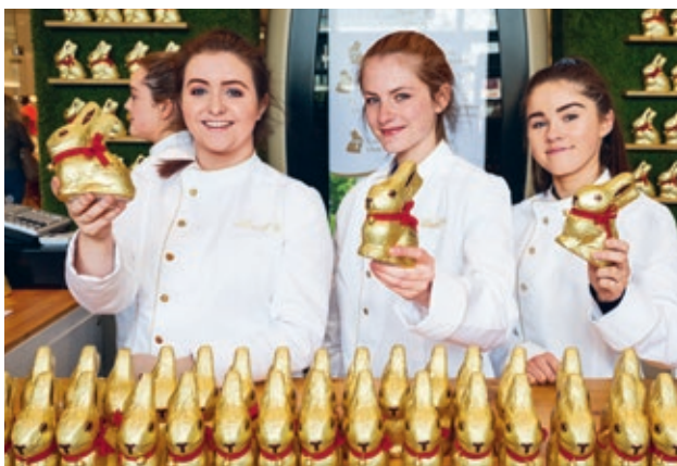
Lindt Gold Bunny personalization for the benefit of the Temple Street Children's Hospital in Dublin.

Lindt launched a series of successful Easter campaigns to reach out to families. The Easter treasure hunt for the Gold Bunny, with product tastings, organized in collaboration with six Royal Horticultural Society gardens, in premium shopping centers and, for the first time, in Hampton Court Palace were all a big success. In Ireland, brand awareness and interaction with consumers were increased through an activity, giving consumers the opportunity to personalize their own Gold Bunny in return for a donation to Lindt's charity partner, Temple Street Children's Hospital. The Lindt Teddy with the Christmas sweater was again a top seller, available this time in a traditional green color.