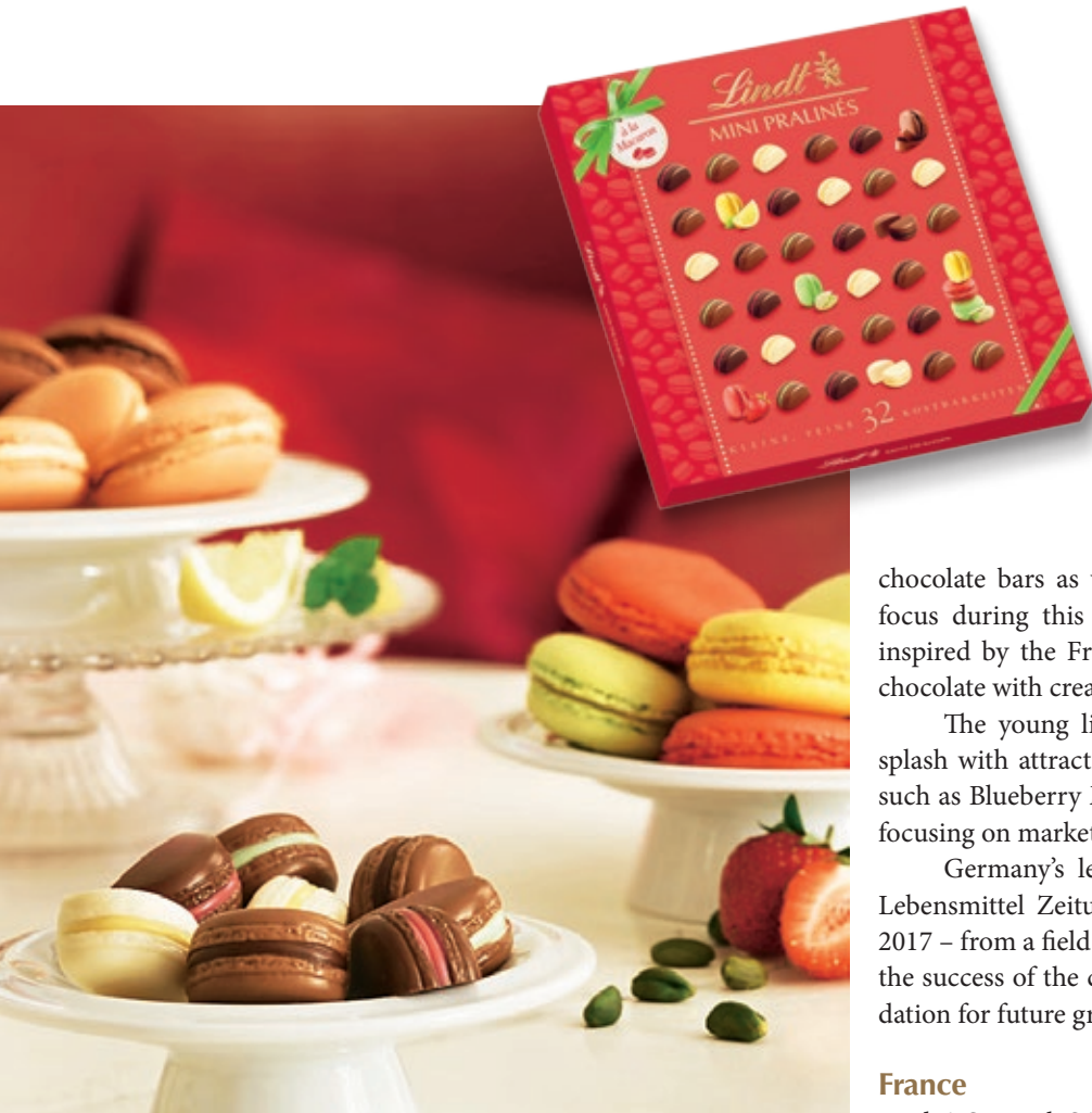
Mini Pralinés à la Macarons, a delicious combination of Lindt chocolate with creamy fillings and crispy meringues pieces.