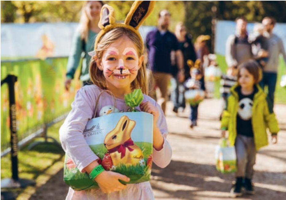
Austria's biggest Easter bunny hunt included many exciting activities in the Botanical Gardens of Vienna's Schönbrunn Palace.

Slovakia. The successful brands Lindor and Excellence were major drivers of this sales growth, while the seasonal business performed well, thanks to successful advertising campaigns for the Lindt Gold Bunny and the Lindt Teddy. In 2017, the Gold Bunny was yet again the top seller among hollow chocolate figures, while the established itself as a popular icon in the Christmas business.