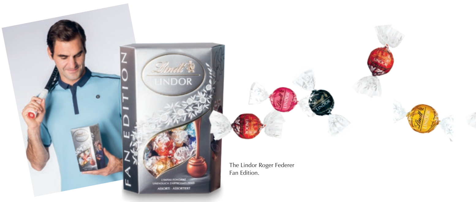
The Lindor Roger Federer Fan Edition.

In 2018, Lindt & Sprüngli Schweiz AG will invest more than CHF 30 million in expanding and modernizing the Lindt Swiss Cocoa Center at its Olten production site. This expansion is seen as a key project for Switzerland as a business location and safeguards the long-term supply of cocoa mass for Lindt & Sprüngli’s European production plants.