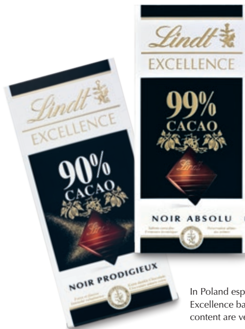
In Poland especially the Lindt Excellence bars with high cocoa content are very popular.

Lindt & Sprüngli (Russia) LLC once again achieved solid double-digit sales growth of +24.5%. The two brands Excellence and Lindor were the biggest growth drivers for this subsidiary's impressive performance in one of the world's fastest-growing and biggest chocolate markets and gained again important market shares. Lindt continued the expansion of its own retail business and opened its second Lindt Shop in Moscow.