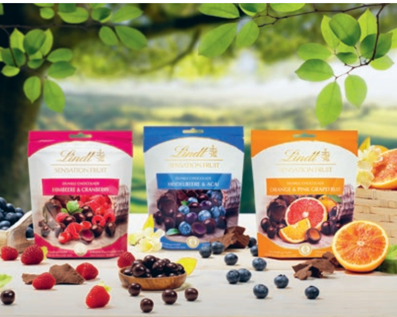
Lindt Sensation Fruits – one of the most successful product innovations from France.